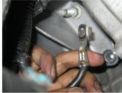
Fig # 10.