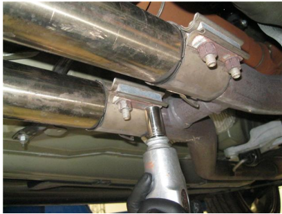
Fig # 3.