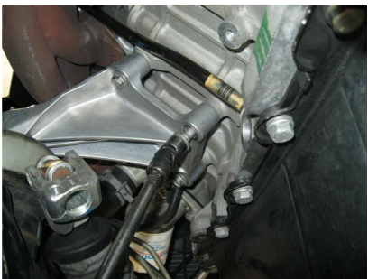
Fig # 7.