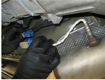
Fig # 2.