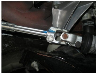
Fig # 5.