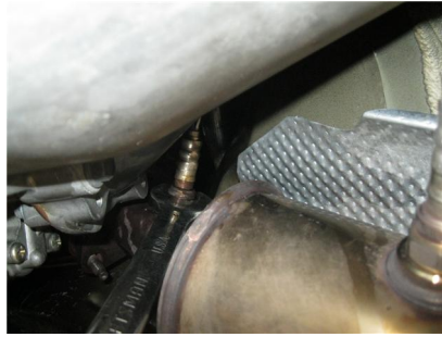
Fig # 4.