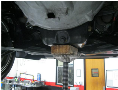
Fig # 6.