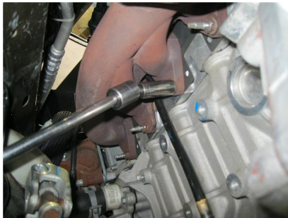
Fig # 8.

Warning: When working on, under, or around any vehicle exercise caution. Please allow the vehicle's exhaust system to cool before removal, as exhaust system temperatures may cause severe burns. If working without a lift, always consult vehicle manual for correct lifting specifications. Always wear safety glasses and ensure a safe work area. Serious injury or death could occur if safety measures are not followed.