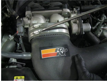
Fig # 1.