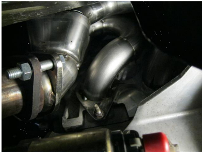
Fig # 11.

Warning: When working on, under, or around any vehicle exercise caution. Please allow the vehicle's exhaust system to cool before removal, as exhaust system temperatures may cause severe burns. If working without a lift, always consult vehicle manual for correct lifting specifications. Always wear safety glasses and ensure a safe work area. Serious injury or death could occur if safety measures are not followed.