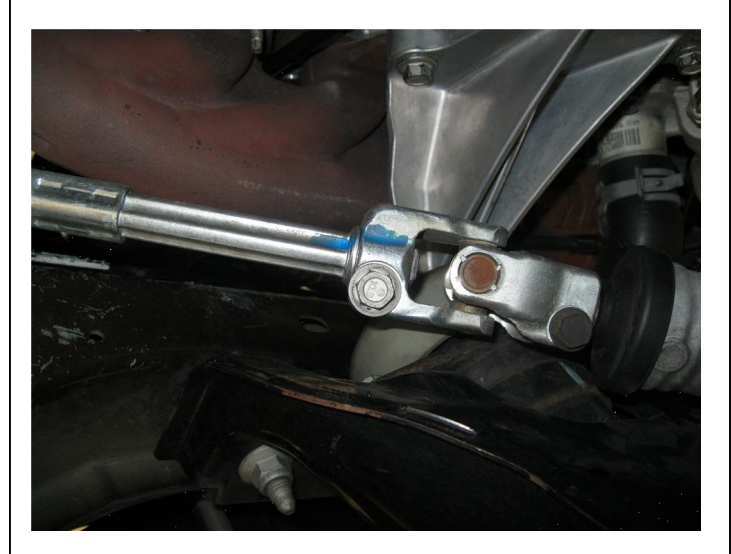
Step 5. Unplug the O2 sensor coupling for the header. When disengaging the steering shaft first mark both the shaft and the universal joint to ensure alignment on reassembly. Remove the retaining bolt and uncouple the steering shaft.