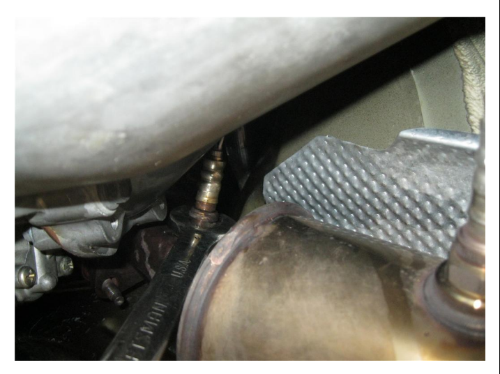
Step 4. Unbolt the O2 sensors in front of the catalytic converters. The H-Pipe assembly may now be removed.