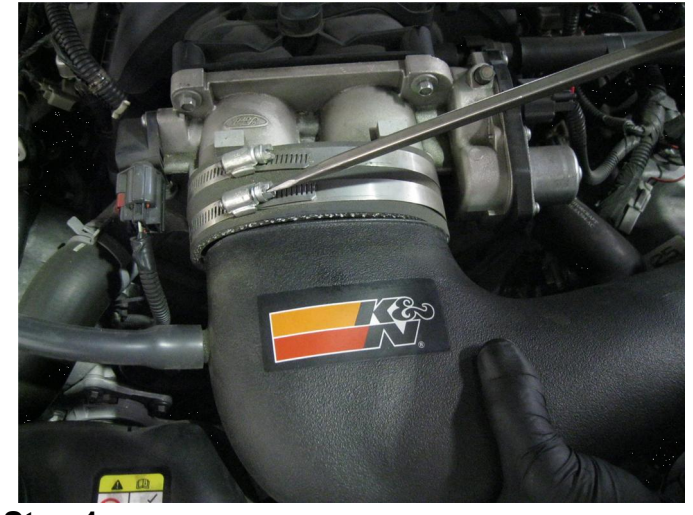
Step 1. Before removing the OEM manifold system, first disconnect the battery. Unbolt the air intake at the airbox inlet by loosening the retaining band clamp. This will allow you to rotate the engine for easier access.