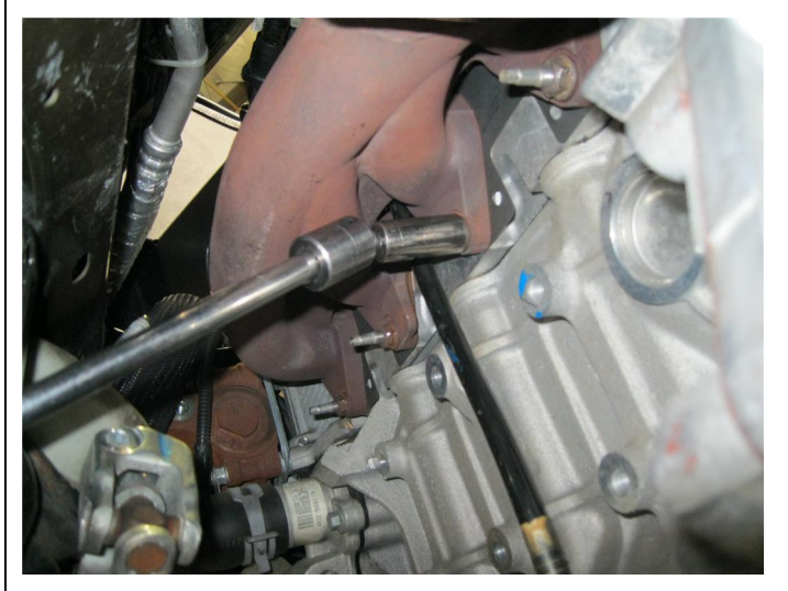
Step 8. The header nuts are now accessible, remove all eight and remove the studs too. The drivers side header may now be removed.

Step 9: To install the new drivers side headers identify and lay out the two subassemblies to ensure correct orientations. Install the D/S header assembly. Use the supplied gasket and header bolts to secure to the manufaturers torque specifications. The engine may need to be raised with the jack for added clearance. Reinstall the motor mount and reconnect the steering shaft, be sure to align the marks you previously made.