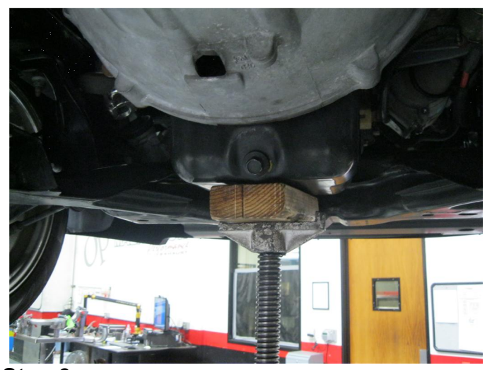
Step 6. Before removing the motor mounts support the engine with a jack.