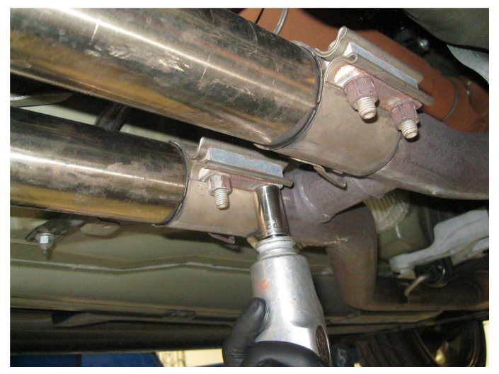
Step 3. Loosen the clamps attaching the H-Pipe assembly and unbolt the H-Pipe flange from the catalytic converters.