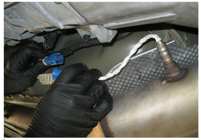
Step 2. Disconnect the rear O2 sensor plugs.