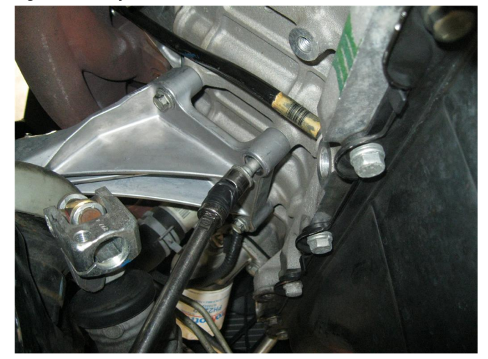
Step 7. The motor mounts may now be unbolted and removed.