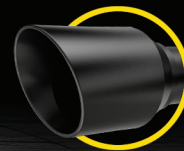
4" BLACK COATED TIPS